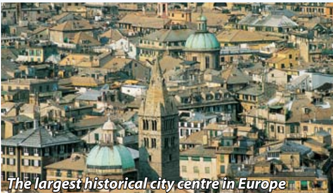
The largest historical city centre in Europe

Genoa: not just for work but for pleasure, too